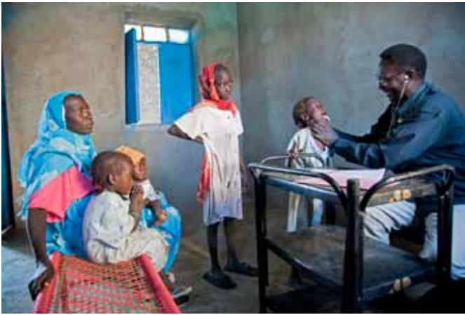
A doctor examines a displaced family in Kalma (South Darfur), before returning to their village in West Darfur