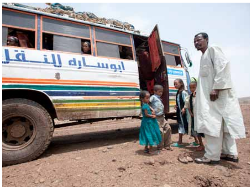
A father and his children board the bus taking them back to their village in Sehjenna, North Darfur