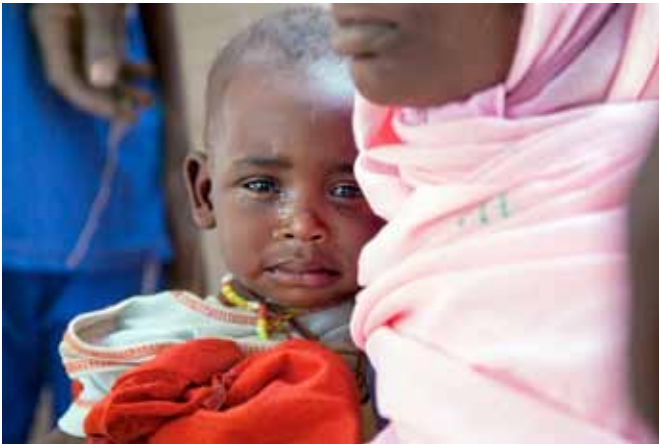
A child in Buru, West Darfur, with a severe eye infection is attended to by UNAMID peacekeepers