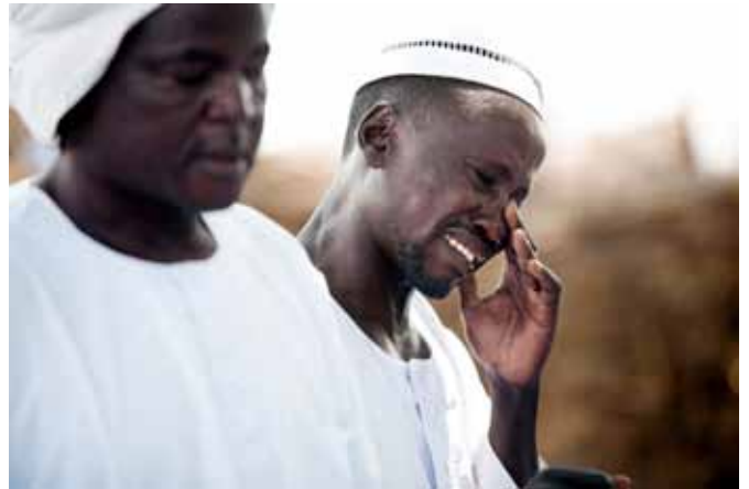
A sheik (community leader) of Mornei camp, North Darfur, who lost family members in recent clashes, cries during a meeting with UNAMID JSR, Ibrahim Gambari