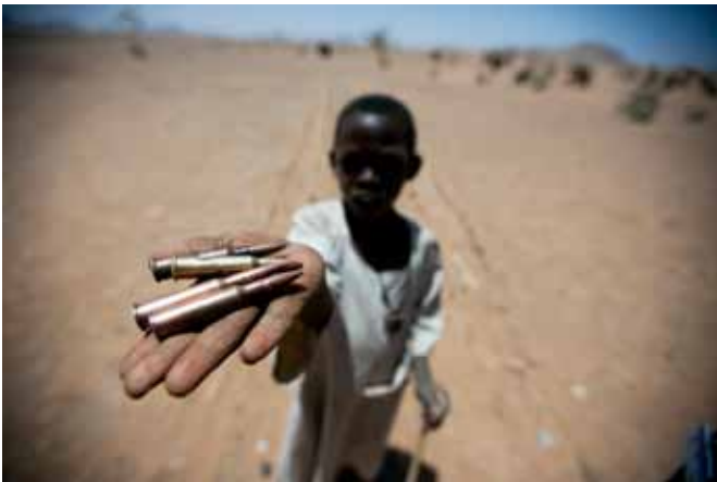
A child displays bullets collected from the ground in Rounyn, a village located north of Shangil Tobaya, North Darfur