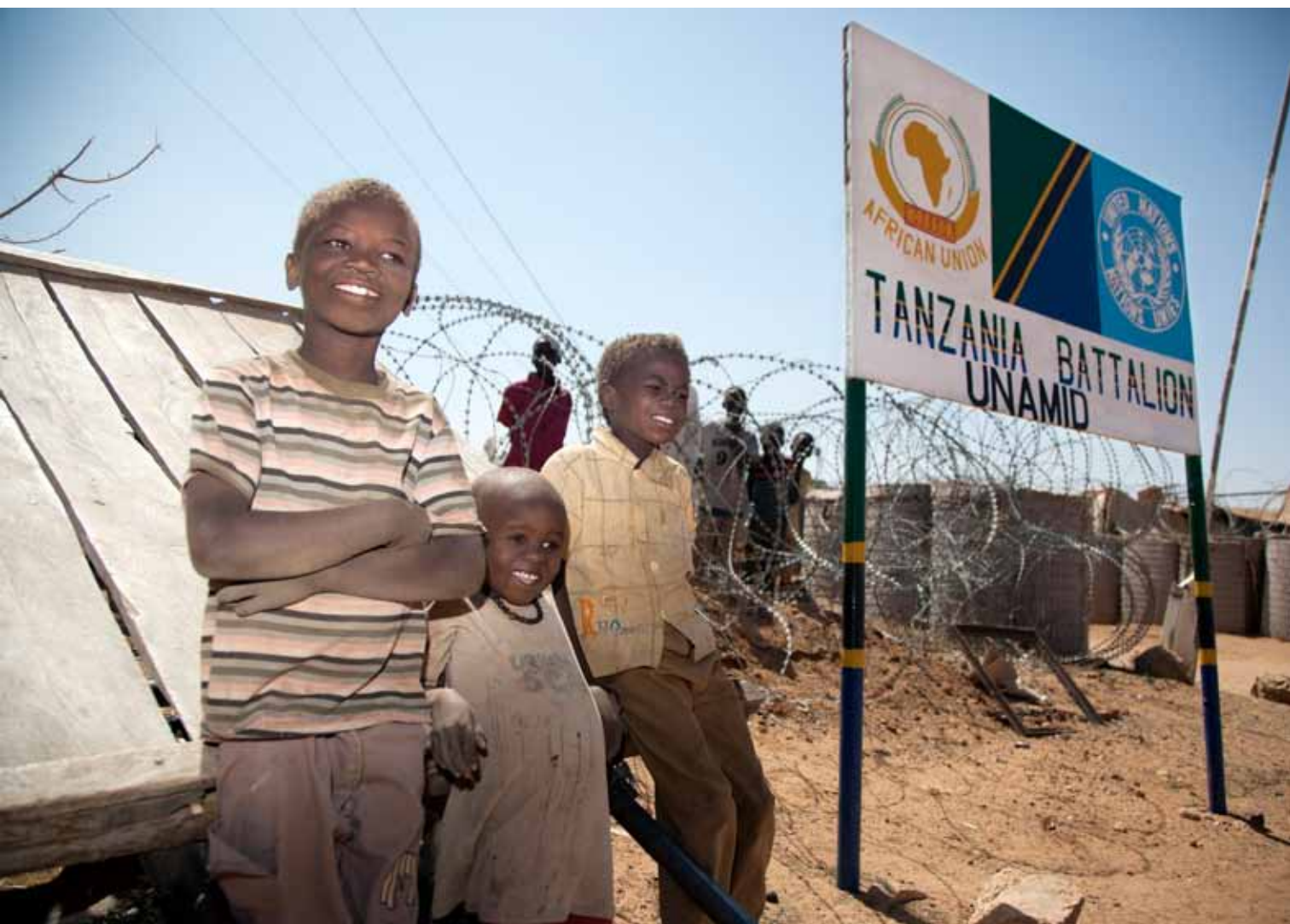
Young Internally displaced boys feel safe at the Tanzanian Battalion team site in Khor Abeche

in December last year in Khor Abeche. Fearing for their lives, they ran to one of the UNAMID team sites next to their village and later erected their shelters around it to form a makeshift IDP camp.