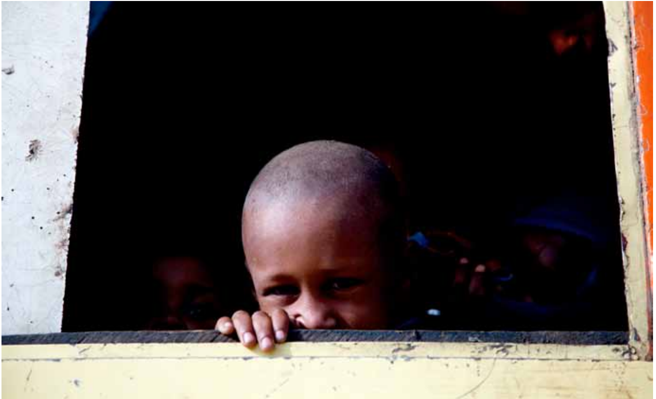
A young boy looks out of a bus transporting returnees back to Sehjenna, North Darfur