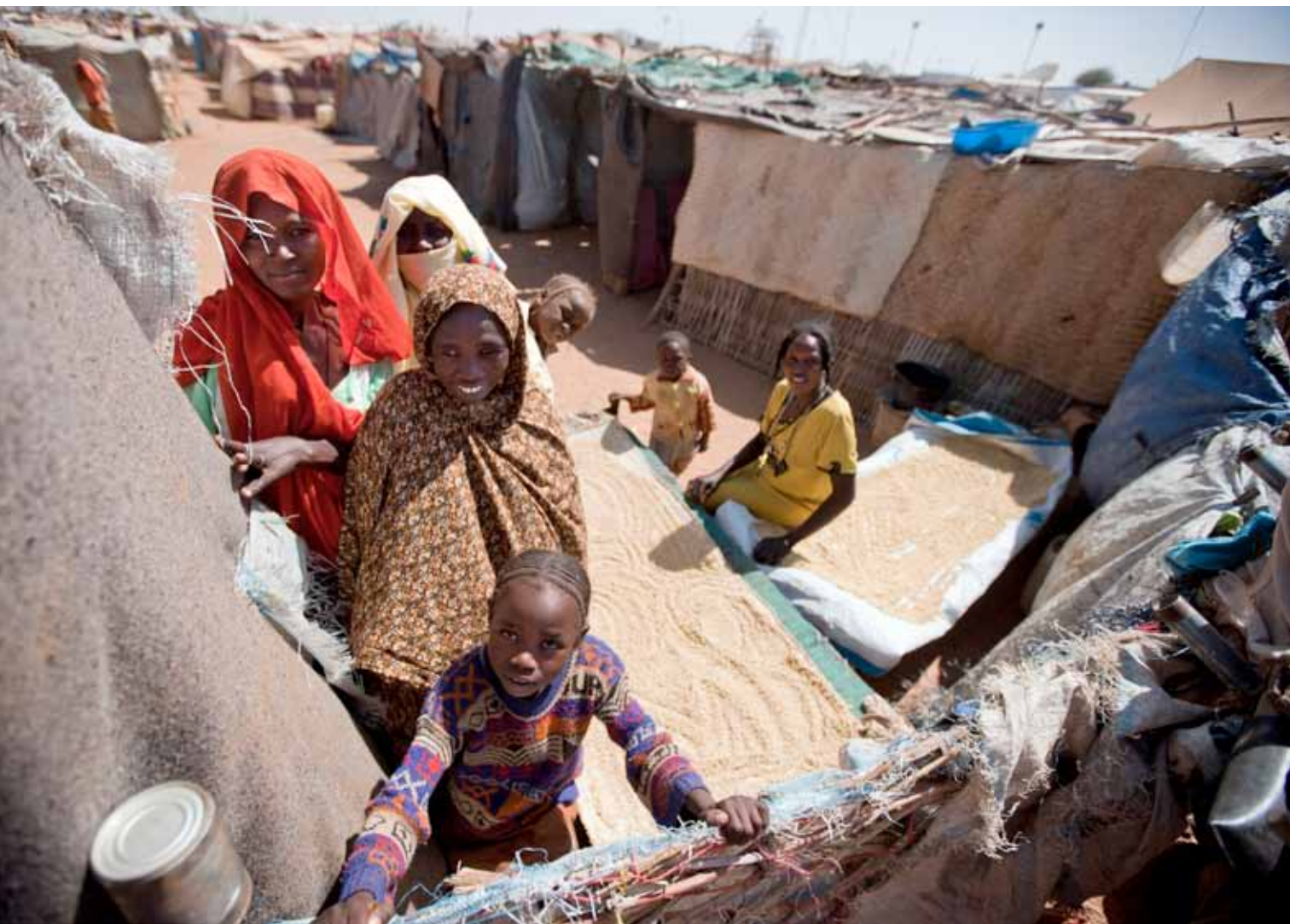
Women and children at theri camp outside UNAMID Tanzanian Battalion team site in Khor Abeche, South Darfur