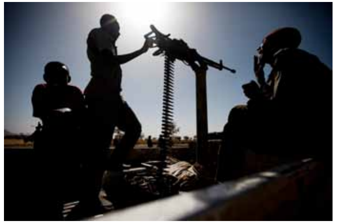
Members of the Sudanese army in Jawa village, in East Jebel Marra, South Darfur