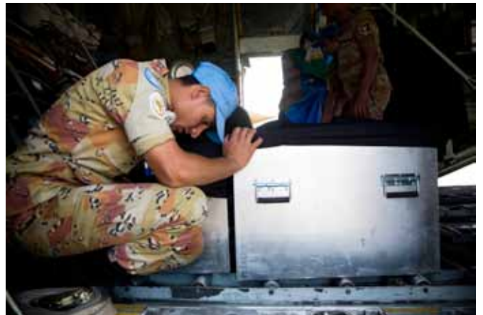
An Egyptian peacekeeper prays beside a fellow soldier's coffin in Edd al Fursan, South Darfur