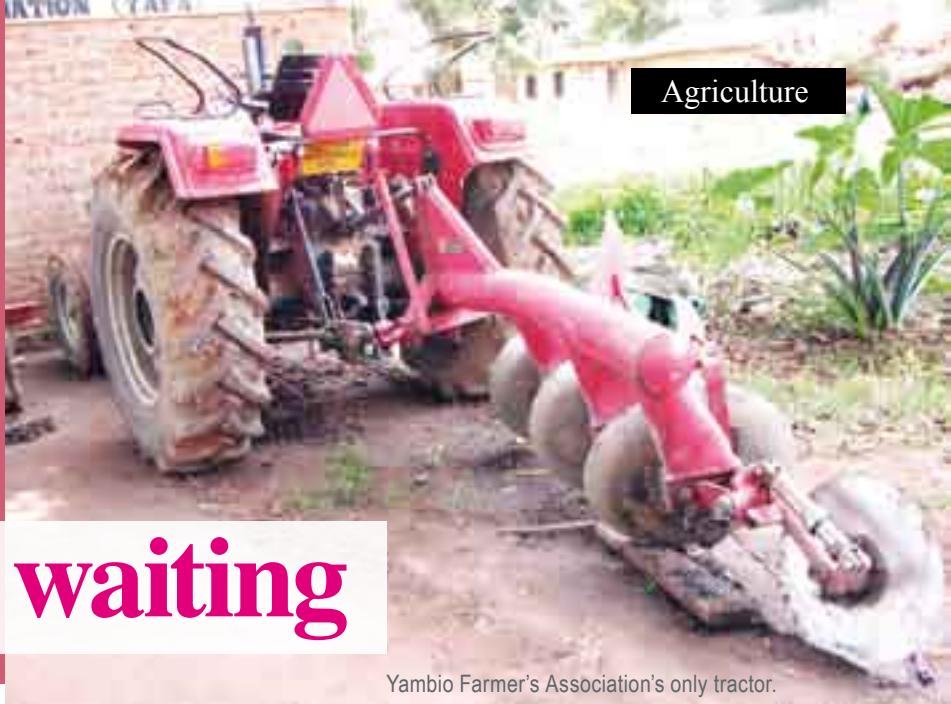
Yambio Farmer's Association's only tractor.