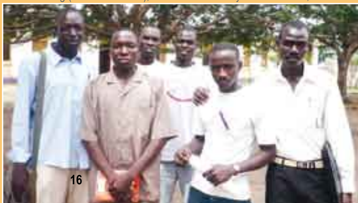
Upper Nile University classroom, Malakal.