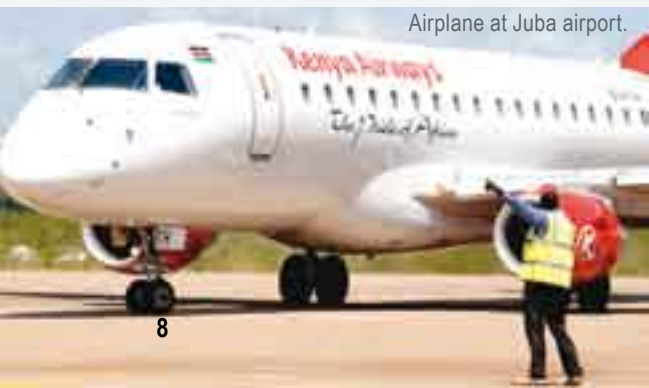
Airplane at Juba airport.