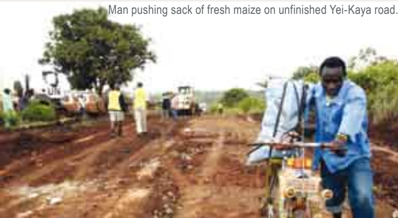
Man pushing sack of fresh maize on unfinished Yei-Kaya road.