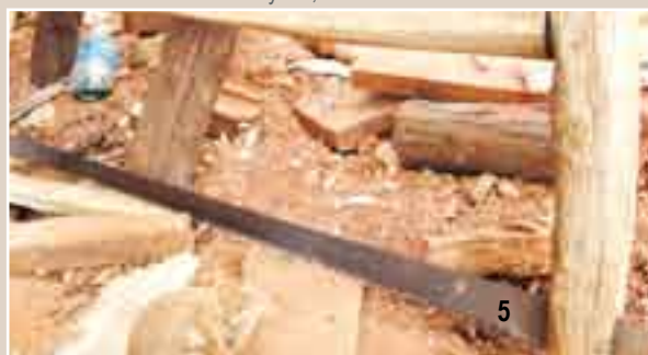
Handsaw at Abarouf boatyard, Omdurman.