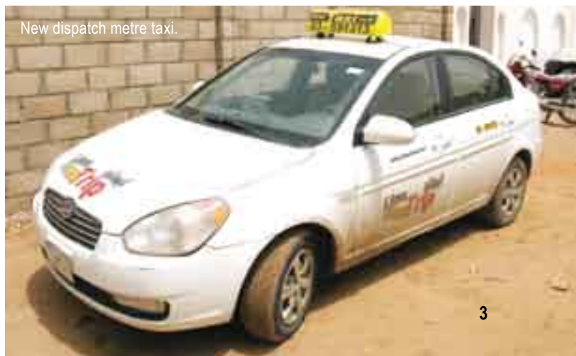
New dispatch metre taxi.