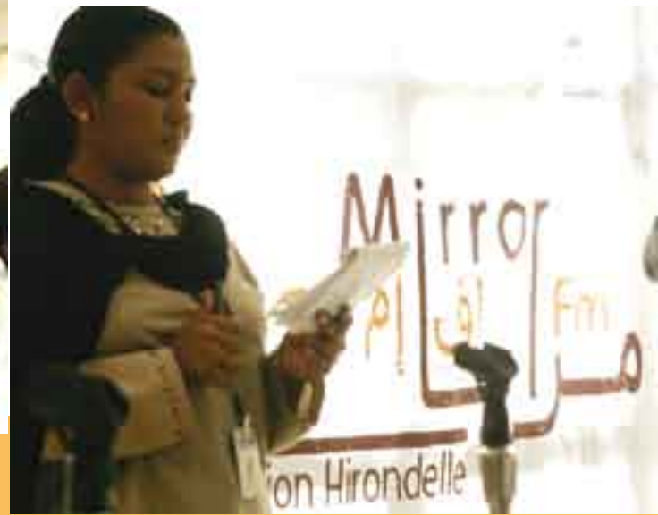
Miraya's fourth anniversary celebration, Juba, Central Equatoria State.

element. Journalists and editors will receive training on the meaning of unity and secession and how to cover referenda polls in a balanced and objective manner.