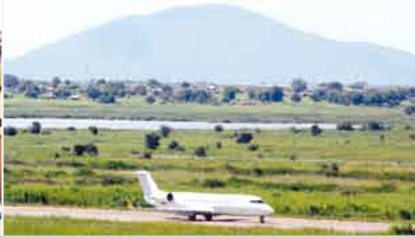
Juba International Airport, Central Equatoria State.