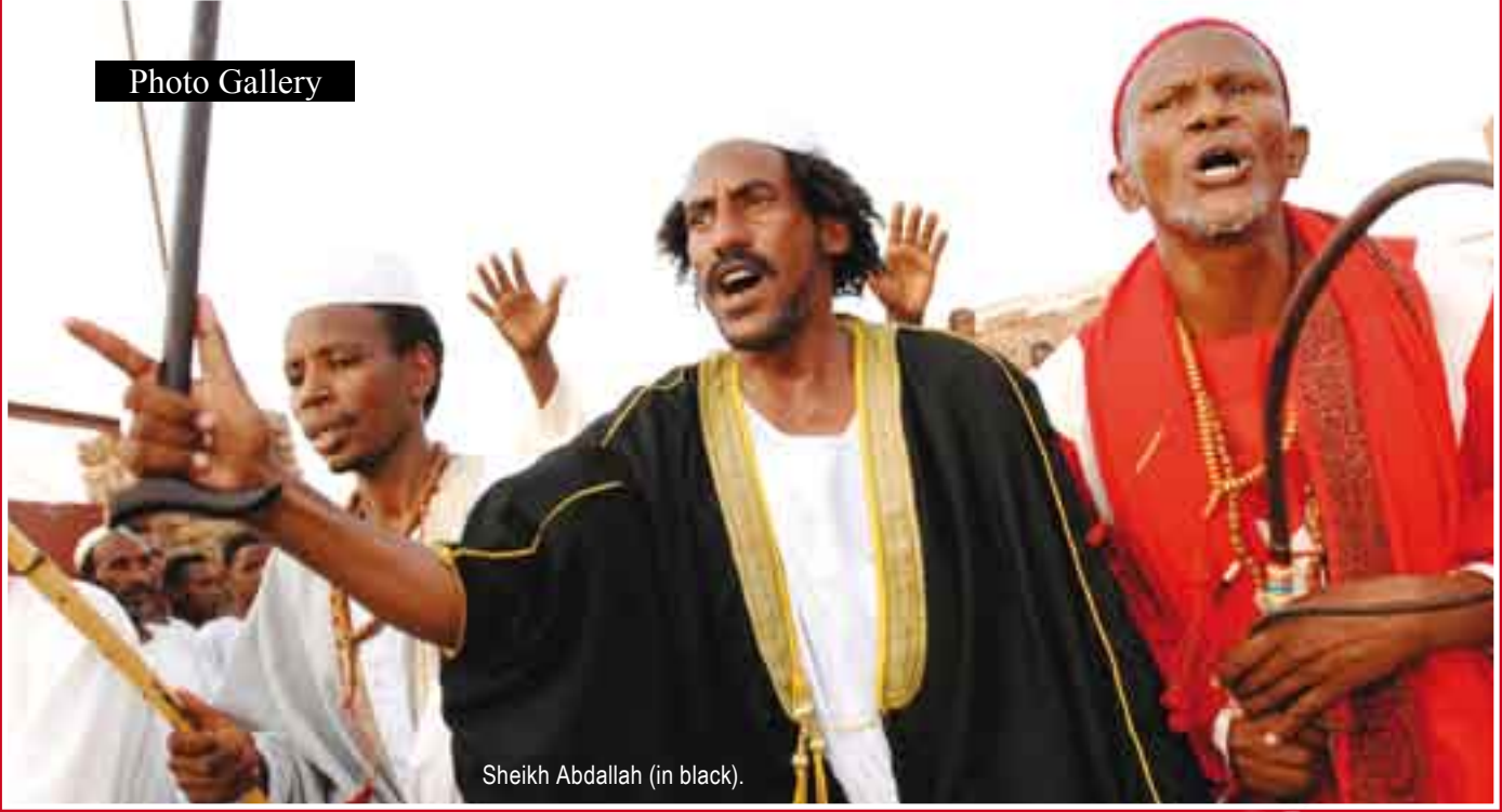
Sheikh Abdallah (in black).