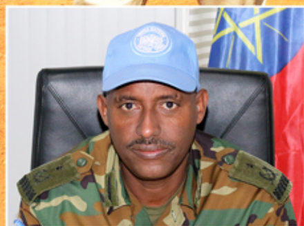
Brigadier General Mulu Girmay Gebrehiwot UNISFA New Deputy Force Commander